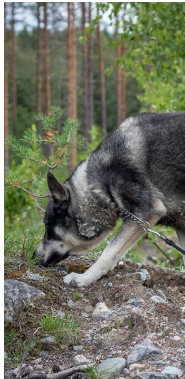
Left: Planning for the next driven hunt.

On our drive north we pass many vehicles that have some form of hunter's orange visible. The bear hunt starts on August 20, and at four o'clock that morning we meet at a clubhouse that belongs to several hunting associations. More than a hundred hunters are gathered there for final instructions. Maps are studied, hounds bark, instructions are given, and then suddenly everything is in motion, with members of every club moving to their own areas. For relatively small fees the hunting grounds are leased by the state or by private landowners. Hunting in Finland is a